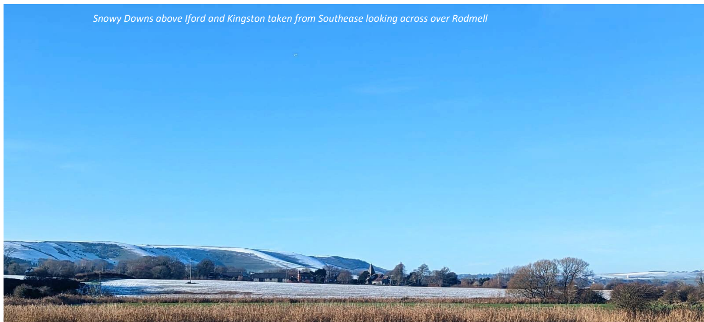
Snowy Downs above Iford and Kingston taken from Southease looking across over Rodmell

For comments on or contributions to this and future newsletters, or you should want to advertise here or if you have a neighbour who would like a paper copy and you are unable to print one off for them, please contact the Editor of the Parish Magazine as below. Deadline 16 th January 2023.